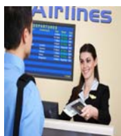
TRIP PLANNING & TRAVEL DISCOUNTS