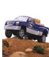
DUALY OVER 1 TON EMERGENCY ROADSIDE ASSISTANCE