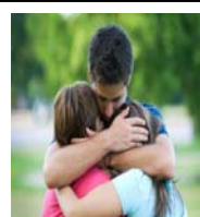
$50,000 ACCIDENTAL DEATH COVERAGE