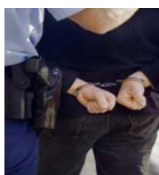
UP TO $25,000 BAIL BOND TO RELEASE YOU