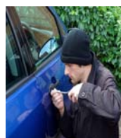
A $5,000 STOLEN VEHICLE REWARD