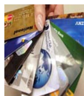
$1,000 CREDIT CARD PROTECTION