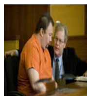
UP TO $2,000 FEES TO DEFEND & $1,000 TO PROTECT YOU