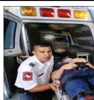
UP TO $500 EMERGENCY BENEFITS