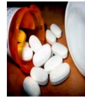
PRESCRIPTION, VISION & DENTAL DISCOUNTS