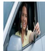
UP TO $500 TRAVEL ASSISTANCE REIMBURSEMENT