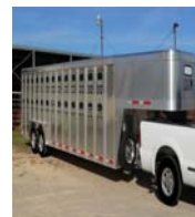
LIVESTOCK TRAILER EMERGENCY ROADSIDE ASSISTANCE