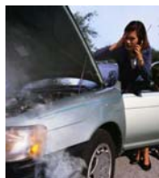
VEHICLE EMERGENCY ROADSIDE ASSISTANCE