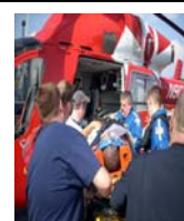
TRAVEL ASSISTANCE PROGRAM