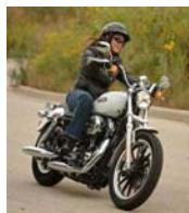
MOTORCYCLE EMERGENCY ROADSIDE ASSISTANCE