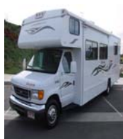
RV EMERGENCY ROADSIDE ASSISTANCE