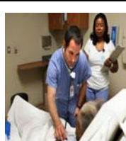
UP TO $54,750 DAILY HOSPITAL BENEFITS