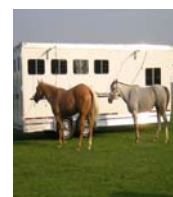
$500 FARM EQUIPMENT REWARD