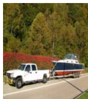
BOAT TRAILER EMERGENCY ROADSIDE ASSISTANCE